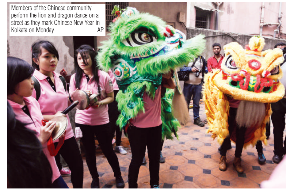
Members of the Chinese community perform the lion and dragon dance on a street as they mark Chinese New Year in Kolkata on Monday